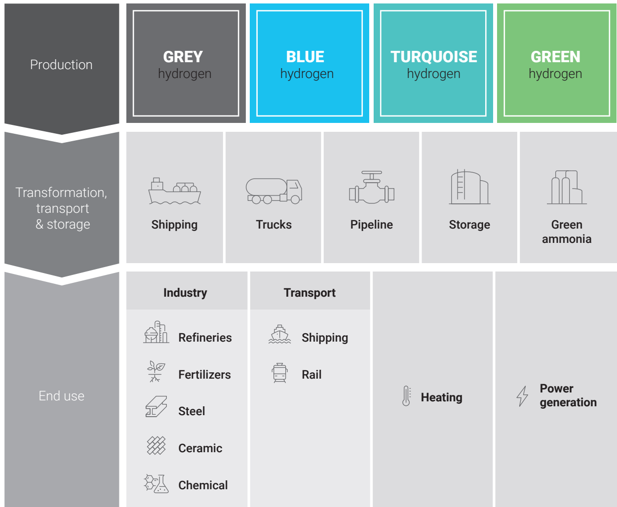
Hydrogen end uses covered with H2Seal range.

our R+D strategy is focused on the industrial and gas grid applications. Once the Hydrogen is produced with different processes depending on the colour of Hydrogen, it should be transformed, transported and stored before the End Use.